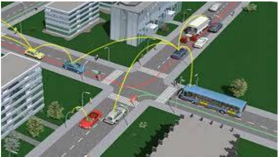
Fig 1 Overview of Vehicular Ad hoc Network

The magnification of the increased number of vehicles which are equipped with wireless transceivers to communicate with other vehicles to create a special class of wireless networks, called as vehicular ad hoc networks or VANETs [1]. VANET is an emerging mobile ad hoc network paradigm that facilitates vehicle-to-vehicle (Fig 1) and vehicle-to-infrastructure communication. The most important application or motivation of the VANET is for driving safety, traffic efficiency, give assistance to drivers. Road condition-awareness is critical for driving safety. Existing VANET- based systems usually thinks that drivers identify t and report safety related road conditions, which however may be false because, drivers may not be willing to perform these duties, or such duties may distract drivers and thus make driving even unsafe. Therefore, automatic detection without human intervention is desired. It has also been studied how to utilize inexpensive roadside devices, such as sensors, to make collection of information and analysis more easy, especially in the absence of connectivity between vehicles. Due to the difficulty of conducting large-scale experiments on real roads, simulation plays an important role in VANET research.